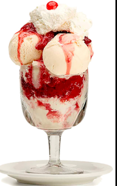
Rita's Strawberry Shortcake

Delicious Vanilla ice cream, Chocolate Brownie and our homemade Hot Fudge, topped off with red Raspberries 14.99