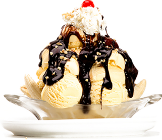
Marie's Hot Fudge