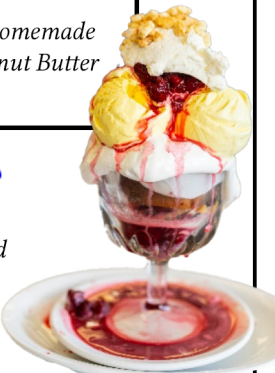
Lena's Lemon Berry Blitz

A delicious Chocolate Brownie served with creamy Vanilla ice cream, topped with our homemade Hot Fudge 11.79