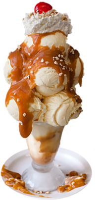
Grandma's Creamery Sundae