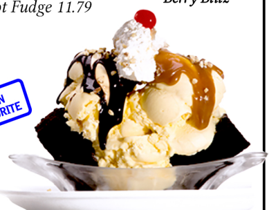
Deacon Dave's Brownie Bliss

Double the Brownie. Loads more creamy Vanilla ice cream, topped with our homemade Caramel and Chocolate Fudge 15.99