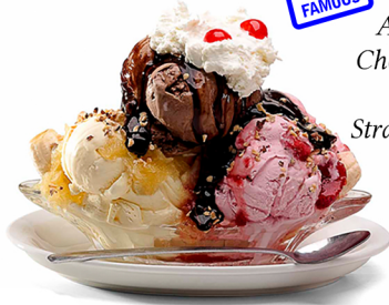
Rich's Banana Split