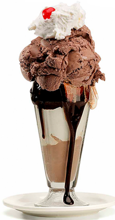
Valerie's Black & White