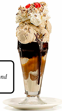
Alan's Black & Tan

Vanilla and Chocolate ice cream smothered with Marshmallow and rich Chocolate Fudge. Regular 13.79 • Grand +2.20